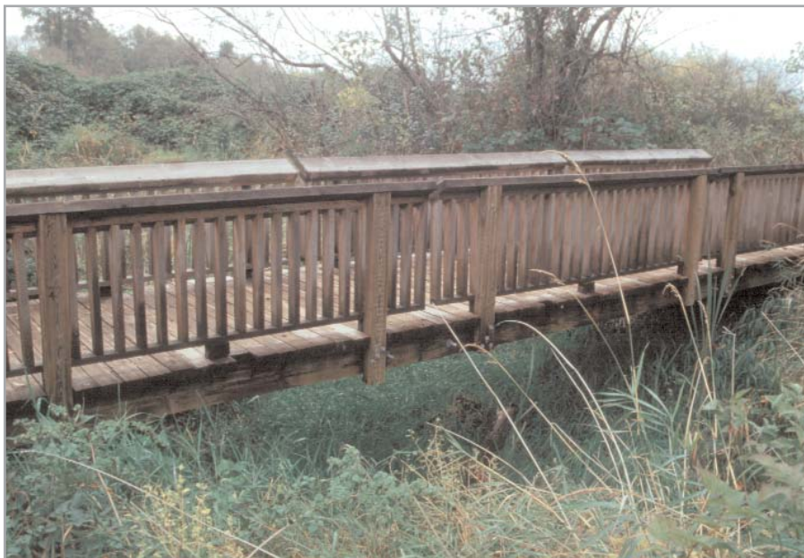
BOARDWALK BRIDGE - Constructed on Diamond Piers without Disturbing the Vegetation or Bank Soils Nisqually Delta National Wildlife Refuge US Fish and Wildlife Service

Pin Foundations are designed to allow Low Impact construction of recreational structures in parks, preserves and wildlands. Now boardwalks, stairways, bridges, shelters and overlooks can all be built in these sensitive environments with minimal site disturbance - saving time and equipment costs, reducing erosion, and preserving the integrity of existing soils, native vegetation and the natural flow of groundwater.