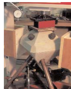
Axial Load Test

This information can be obtained from sampling within the typical pin depth - 3 to 5 feet for most soils, (deeper for soft conditions) - and need not involve a testing lab or expensive coring equipment. Most local geotechs can make these determinations with a single field visit, or be able to determine the information from regional soil surveys or previous soils studies done on site.