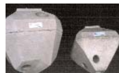
DP-100 & DP-50

There are two pier sizes - a fifty pound pier, the DP-50 , and our original 100 pound pier, the DP-100 . Each has different Pin diameters and corresponding capacities, allowing maximum flexibility and cost control in the design and support of surface structures.